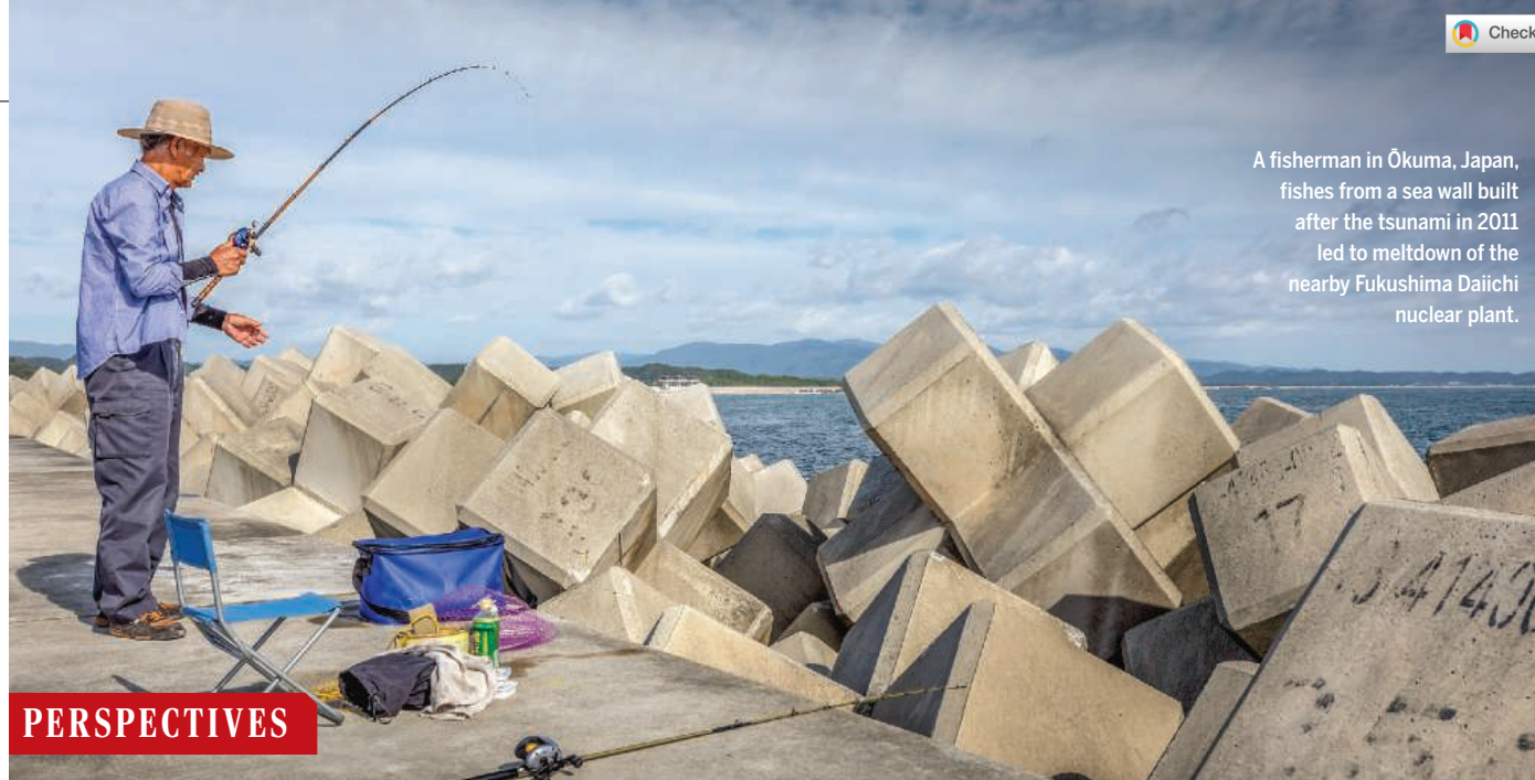
A fisherman in Ōkuma, Japan, fishes from a sea wall built after the tsunami in 2011 led to meltdown of the nearby Fukushima Daiichi nuclear plant.